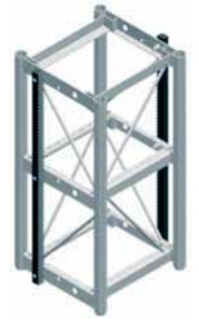
M650 Length 59" (1.5 m) Weight 308 lb (140 kg)