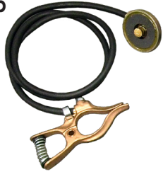
Ground Conducting Clamp