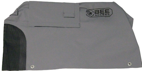
Optional Hoist Covers