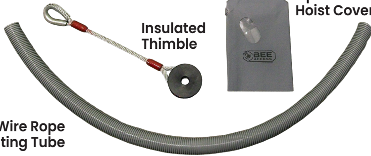
Wire Rope Insulating Tube