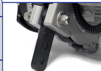
Fold-up Stirrup Bar included only on 308-1000L models without overload device

Quick turnaround service with easy access sheave inspection side covers. Fewest number of wear parts of any hoist on the market, reducing service time and operating cost. Easy (dis)assembly due to minimal number of bolts and components.