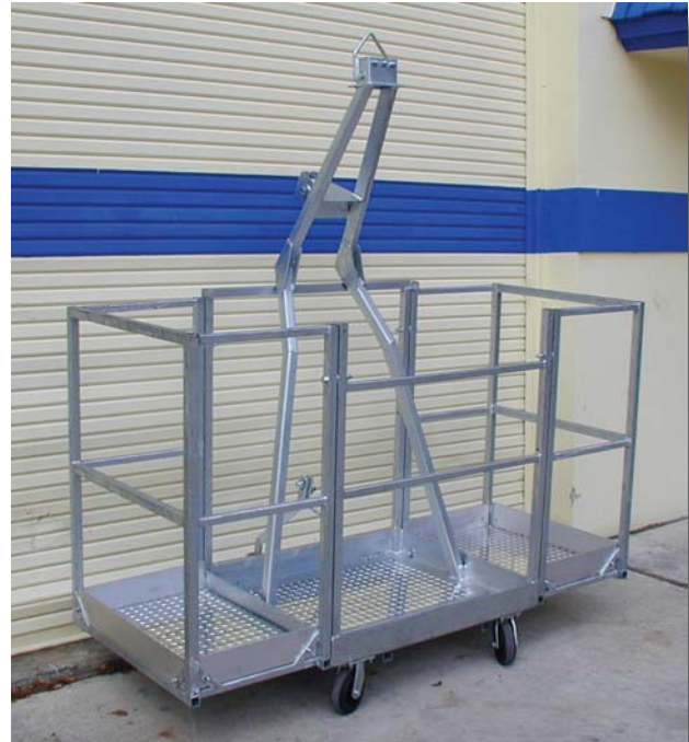
Optional: 930112 - Work Cage Extensions (set of 2)